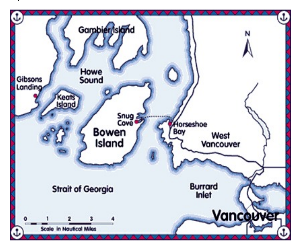
Figure 1 - Map of Bowen Island in relation to British Columbia and Vancouver (http://members.virtualtourist.com/m/1b080/de626/)

local community and economy. It will examine the opportunities and constraints for cultural producers resident on the island. The study draws on social network analysis to explore the relation of screen producers to productions and locations, and uses information gathered from fieldwork<sup>2</sup> including interviews with relevant personnel and observation, and analysis of media texts and literature sources. An overview of Bowen Island is followed by discussion of local and external productions, leading to a discussion of these screen productions as reflective of creative industries functioning in a specific island location.